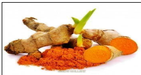
Figure 1: Curcuma longa

Turmeric, derived from the rhizomes of Curcuma longa , is a perennial plant having short stem with large oblong leaves, and bears ovate, pyriform or oblong rhizomes, which are often branched and brownish-yellow in color. Accounting for about 78 percent of world turmeric production, India is the largest producer of turmeric.