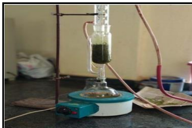
Figure No 4: Extraction process

The collected plant parts were crushed to powder. The powder was extracted with 7:3 hydro alcoholic mixtures, at 60°C temperature, for 6 hrs, in a 500ml round bottom flask. After 6 hrs of extraction, round bottom flask was cooled to temperature and the extract were filtered and picked up. Decoction was prepared by evaporating the extract to at least one third of its volume. Decoction was poured onto a glass tray and dried at 100°C. Dried extract was pulverized and stored in a desiccator.