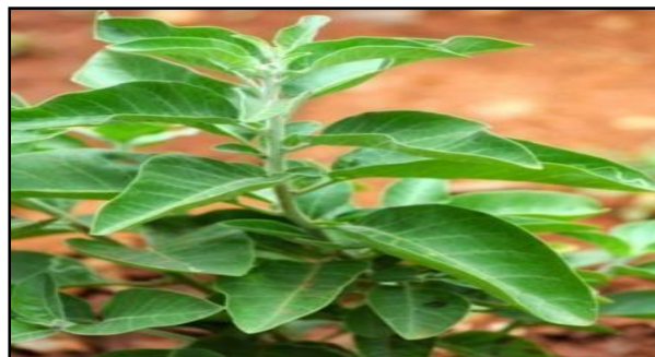
Figure no 3: Withania somnifera

Withania somnifera is a small, woody shrub that grows about two feet in height. It can be found growing in Africa, the Mediterranean, and India.