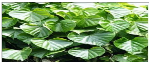
Figure 2: Tinospora cordifolia

Tinospora cordifolia is a large glabrous, perennial, deciduous, climbing shrub of weak and fleshy stem found throughout India.