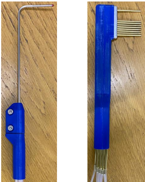
Fig. 2: Comparing the design of a seven-hole probe (left) and the pitot rake (right).

The performance of the pitot rake was tested against a pre-calibrated seven-hole probe, supplied by Surrey Sensors. As the company is a reputable supplier of the automotive industry, it is believed that their equipment is a good performance benchmark. The assembled pitot rake and seven-hole are shown in Fig. 2.