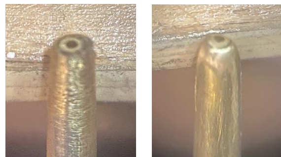
Fig. 4: Microscopy photograph of the pitot tube before (left) and after (right) it was carefully sanded.

As a result, the rake was disassembled and each pitot tube was carefully sanded under a microscope. As shown in Fig. 4, this process resulted in a substantially smoother profile and noise in the data was reduced to satisfactory levels.