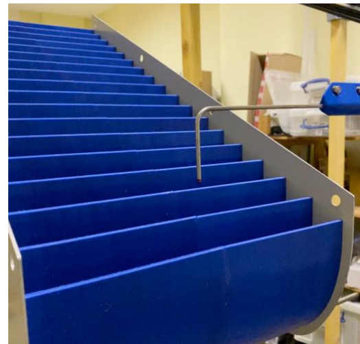
Fig. 3: A seven-hole probe characterising the flow field downstream of a vane cascade.

did not interfere with the measurements, the first and final 1.5 seconds of each sample were discarded, resulting in an actual sample time of 5 seconds. The pressure scanner measures the pressure at a rate of 100 Hz, resulting in a sample size of 500 points for each location. This was deemed sufficient for the scope of this test.