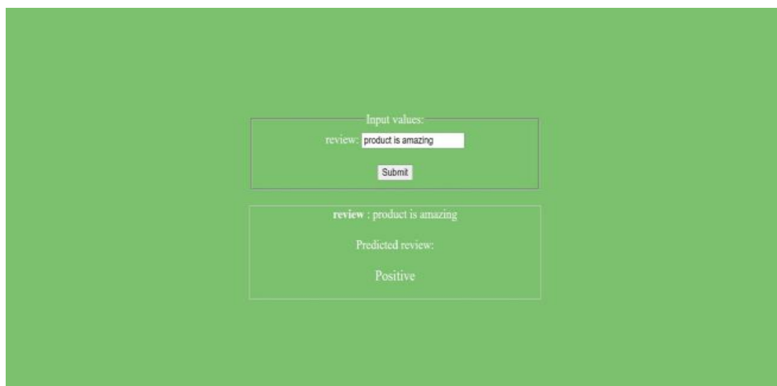
Figure: 1.3 Results for this model using the logistic regression

deployed the model using flask to know how the result will be if the user gives the feedback and we got accurate results for this model using the logistic regression.