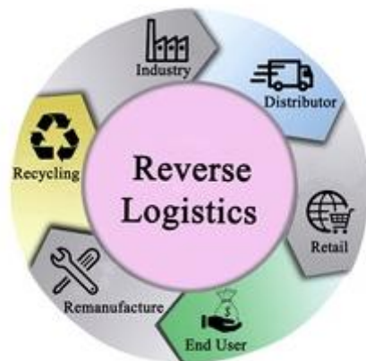
Fig. 3 Reverse logistics

Reverse logistics is another effective area for products flows from point of consumption to its point of production or origin. Different types of processes have been applied to reverse logistics such as planning, controlling and implementing. Reverse logistics is used for the management of hazardous materials, logistics recycling, and waste disposal. It is also related to all logistics activities carried out in source of reduction, disposal, reuse and recycle of materials.[6]