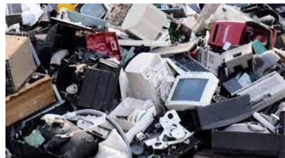
Fig. 1 E-wastage

India generated 277 million tons of solid waste in 2016 [3], 708,445 tonne of e-waste in 2017-18 and 771,215 tonne the next fiscal, the report estimated. In 2019-20, the figure increased by 32 per cent upto 1,014,961 tonnes. These figures considered the 21 types of electrical and electronic equipment which are listed in the E-Waste Management Rules, 2016.[4]