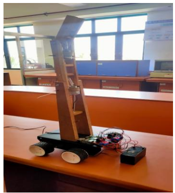
Fig 2. Robotic Arm and Base

Fig.2. shows the chassis part which is similar to that of a four-wheeler platform. It comprises of wheels, torque motors and a platform. The chassis is made up of a metal body of dimensions 24cm length & 7.5cm breadth assembled with the wheels of diameter 6.5cm along with four 12V DC Motors which are connected to each wheel of the chassis [2].