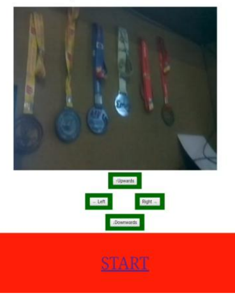
Fig 4. Pi camera Stream

Fig 4. shows the Android Application developed for this system. Each of these buttons are being specified with certain features. First of all, the connection is being established with the Raspberry Pi using Wi-Fi facility. The IP address of the Raspberry Pi need to be entered in the browser section for the establishment of connection. Webpage contains video streamed real-time, arrow buttons for controlling the motion of robot and start button for initiating disinfection action. PiCamera v.1.3 is used as camera for the robot. Video streaming code was written using existing APIs of PiCamera class (source code). URL that was generated for the webpage http://<Raspberry_Pi_IP_Address>:8000 which is to be used to access the control page. The Raspberry Pi IP address is unique for each Pi module. This will prevent the robot to be controlled by someone other than the person assigned for the task. Also no overlap between different robots of the same kind will occur. The Real time video can be obtained on the screen so that we could get to know the current