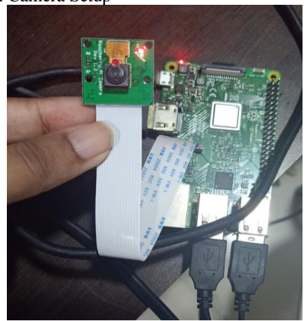
Fig 3. Pi Camera setup