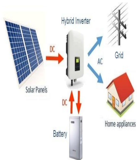
Figure 3 hybrid mode

For smart energy management, we use a hybrid model in which the battery bank operates the inverter, as shown in Figure 3.[3]