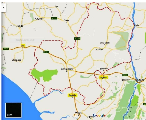
Figure 1: Map of study area and selected roadway systems [7]

Each route was assessed for the distribution of typical geometric design elements (horizontal curvature, vertical grade as well as roadway cross-sectional elements). These roadways were been selected on the basis that they represent major routes which permit the movement of large volumes of vehicular traffic for trucks and connect major points of traffic generation with industrial and commercial distribution points in Southern Nigeria. Figure 1 highlights the truck haulage routes selected and investigated.