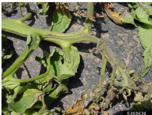
Figure 2: 28-spotted ladybirds.