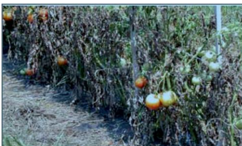
Figure 2. Defoliation caused by early blight.