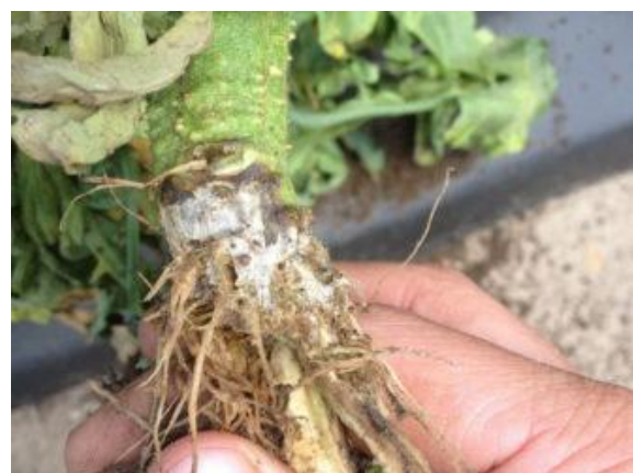
Figure 4: Sclerotium rolfsii (accuracy 88%)