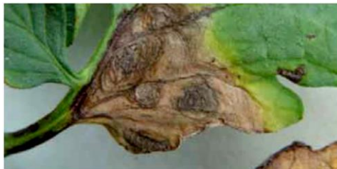
Figure 1. Leaf spot cause by the early blight fungus.