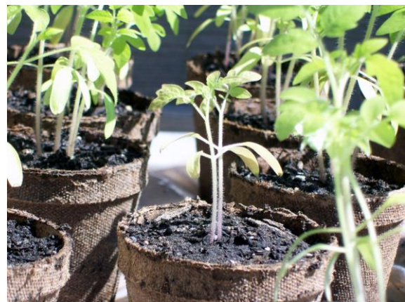
Figure 5: Healthy Tomatoes.