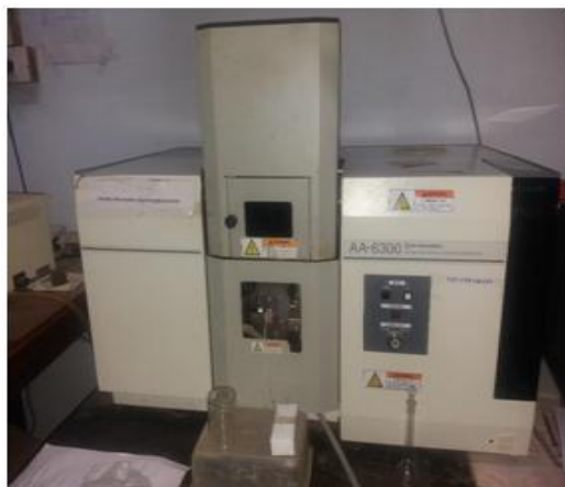
Fig.5. AAS (Atomic Absorption Spectroscopy)

The technique makes the use of the atomic absorption spectrum of a sample in order to assess the concentration of specific analysts within it. It requires standards with known analyte content to relation between the measured absorbance and the analyte concentration and relies therefore on the Beer-Lambert law.