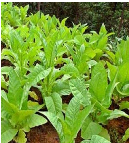
Fig. 1. Nicotiana Tabacum

The low cost, plant based phytoremediation technique has often been described as a promising technique to remediate agricultural land contaminated with e-waste. The plants used, have to meet certain requirements, which are fulfilled by tobacco. It is a fast growing plant with a high biomass, which is easily harvested. Its propagation is very simple, as each of the plant generate thousands of seeds. Tobacco has also revealed a high tolerance for various organic and inorganic pollutants. It can accumulate heavy metals in relatively high levels , especially Cadmium, Copper, lead. It's rapid growth, high leave biomass and its high disposition for transformation has made tobacco an optimal plant for the genetic engineering. It has not only been applied in the field of medicine and also in the area of phytoremediation. Metal chelator, metal transporter, metallothionin and phytochelatin genes have been transferred to plants for improved metal uptake and sequestration. In our project, we get the result by using the Nicotiana tabacum for phytoremediation of the heavy metals which present in the e-waste contaminated site.