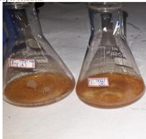
Fig. 2. Before Treatment

the observation. After 5 days the treatment was done and the plants should be taken for analysis. Before analysis the plants should be burn and digested in a proper solution.