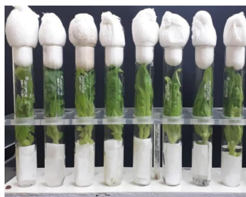
Fig. 3. After Treatment