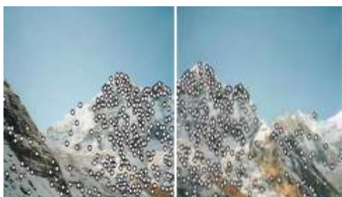
Fig. 2: Images (A) and (B) represent feature detection [6]

geometric (e.g. number of end points, branches, joints, concave/convex parts etc) and Global features, which are usually topological (connectivity, projection profiles, number of holes etc) or statistical (invariant moments etc) [5].