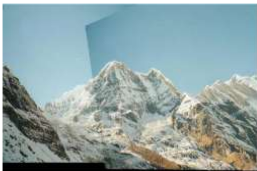
Fig. 4: Final images resulting from the blending of the two consecutive images [6]

Image blending is the technique, which is used to obtain the smooth transition between images by removing the seams and minimize the intensity difference of overlapping pixels. A blended image is created by determining how pixel in an overlapping area should be presented.