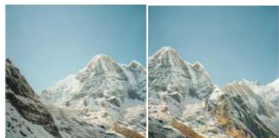
Fig. 1: Images (A) and (B) represent Image Acquisition in same scene with different angles [6]

Registration methods can be divided into following types: algorithms that use image pixel value directly, e.g. correlation method [2]; algorithm that use frequency domain, e.g. FFT-based methods [3]; algorithms that use low level features such as edges and corners, e.g. feature based methods [4]; algorithms that uses high level features such as identified objects, or relation between features, e.g. Graph-theoretic methods [4].