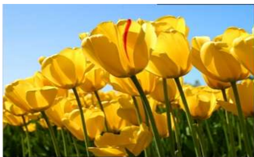
Fig. 9: Fused image using DCT