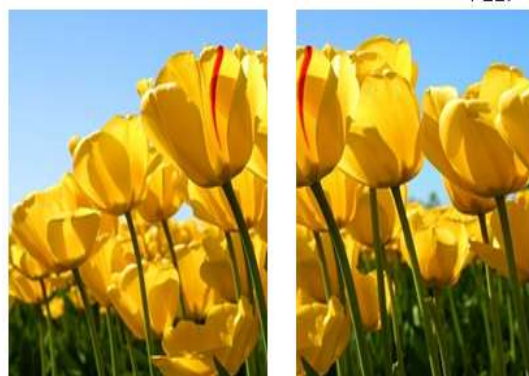
Fig. 8: Input images