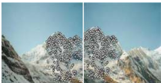
Fig. 3: Inliers after RANSAC between images (A) and (B) [6]

Homography is the mapping between two spaces which is often used to represent the correspondence between two images of same scene.