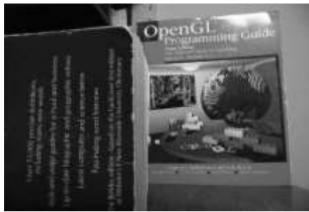
Fig. 6: Output image obtained by fusion [31]