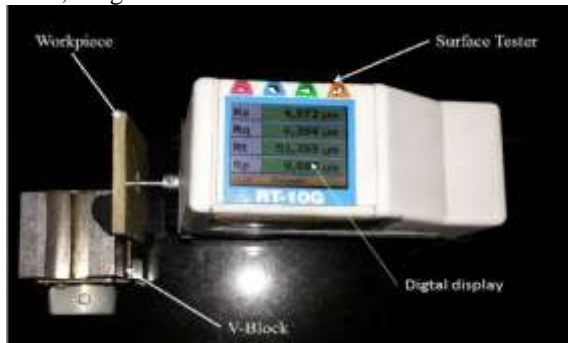
Fig (2): Set up of measuring surface roughness of drilled hole in GFRP by roughness tester

A roughness tester shown in Fig. 2. made by Strumentazione, Japan Model RT10G having LC 0.001 \mu\text{m} is used to find out Roughness value ( R_a ) of each drilled hole. The probe may be turned by 90^\circ to persist the measurements in the grooves between shoulders. On the integrated display, which is shielded by a protective membrane, the roughness parameter can be read easily. In this machine up to 30 readings can be save to ensure mobility. The tester delivered with the skidded pickup SM-SB10, V-block, roughness master.