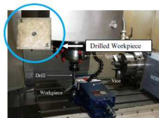
Fig (1): Closed view photograph of experimental set up

The preparation of the experiment started with the cutting of nine work pieces to the required size from a plate of GFRP. These GFRP work pieces are exactly made to size 57 mm X 57 mm X 5 mm. A Vertical Milling Centre (VMC-1260) is used for machining purpose having 12KgF maximum load table capacity. The GFRP workpiece is hold by vice as shown in Fig. (1). Initially a centre drill was made so as to ensure accurate drilling of GFRP workpiece. Then according to L9 orthogonal array a drilling is conducted in each workpiece. After drilling the workpiece is unclamped from vice and then it was dried by a pressurised air nozzle. Each drilled workpiece is covered by a plastic sticky paper for protecting hole by dust and swarf.