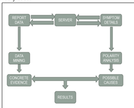
Fig 1: Block diagram of Medical Knowledge Globalization Analysis and Research

Based on the requirements of the Ordinance Hospital we have developed this system that contains the disciplined way of report generation and analysing of the same. Also considering the various problems faced in the commonly used hospital management system, we are implementing this system with the advanced features of polarity analyser. This analyser will take the inputs from the other module of the system and generate the results based either on positive sentimentation or negative sentimentation. Hence this will be represented in the form of the pie-chart. In support to the system is data