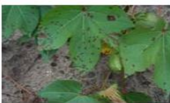
Fig -3: Bacterial Blight

Xanthomonas campestris PV. Malvacearum Bacterial blight starts out as Dark green, water soaked angular leaf spot of 1 to 5 mm across the leaves and bracts, especially on the under surface of leaves with a red to brown border