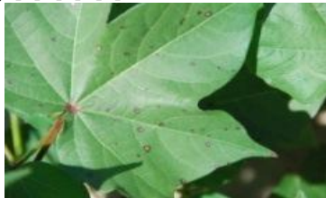
Fig -1: Foliar leaf spot on cotton

As shown in above figures the, the disease is known as foliar disease arises due to potassium deficiency [2], [3], [4].