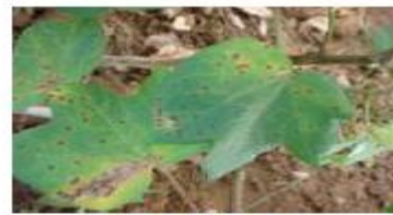
Fig -4: Alternaria Leaf Spot-alternaria Macro Spora

This causes small, gray, pale to brown, round or irregular spots measuring 0.5 - 3 mm in diameter and cracked centers appears on the affected leaves of the plant. Affected leaves become dry and fall off [2][3]