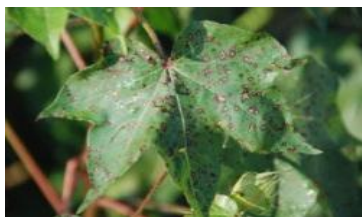
Fig -2: Foliar leaf spot on cotton

The early stage of this disease is as shown in fig 1, now if the more spots of this disease results into the final stage of this plant where the plant leaf is get fall so it is called as Foliar disease of the cotton plant as shown in fig 2. The leaf is having multiple no of spots which clearly denotes more potassium deficiency in the plant. [3]