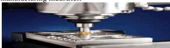
Fig.1.3 End milling operation

The cutter, called end mill, has a diameter less than the workpiece width. The end mill has helical cutting edges carried over onto the cylindrical cutter surface. End mills with flat ends (so called squire-end mills) are used to generate pockets, closed or end key slots, etc. End milling is the most common metal removal operation encountered. It is widely used to mate with other part in die, aerospace, automotive, and machinery design as well as in manufacturing industries.