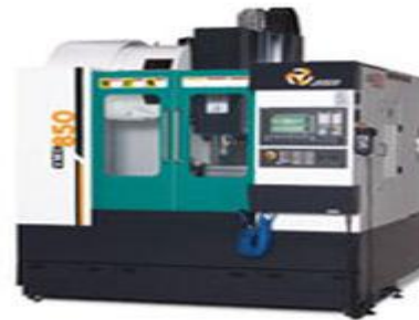
Fig.1.4 CNC Machining Center (VMC 850)