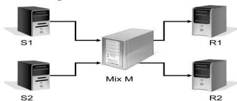
Figure 1: A single mix.

In proposed system, in order to tweak Nymble System to allow users to access Internet services privately by using a series of mix servers and proxy repositories to hide the client's IP address from the target servers instead of the multiple routers based ip hiding approach of prior systems. A mix network consists of multiple mixes that are interconnected by a network as shown in figure 1. Such a mix network may provide enhanced anonymity, as payload packets may go through multiple mixes. Since the end-to-end performance of any mix network eventually relies on the performance of its individual mixes, the analysis of the single mix provides a foundation for analyzing the end-to-end performance of mix networks.