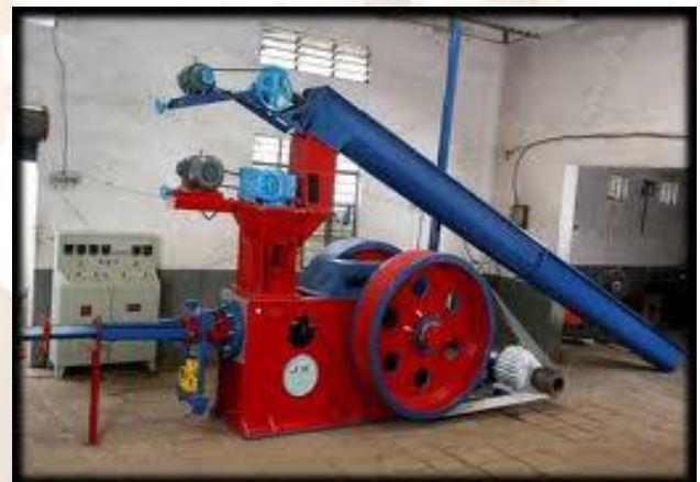
Fig Biomass briquetting System

Material has high moisture content needs to be dried either by sun drying or using separate flash drier(optional). The raw materials then mix as per convenient. The mixed raw material has fed to vertical screw conveyer. The conveyer has taken the material to chamber of briquetting press. Then the material is compressed by the press by forcing it through the die with tapered bore. The compression raises the temperature of material, and binds the material together. Briquettes formed are cylinder shape. Which are pushed through cooling tracks under slight pressure for cooling and transport to packing point, where the briquettes are packed and stored for dispatch. The diagram of briquette machine is as follows.