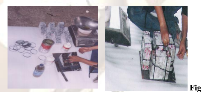
1 Preparation of plaques for Bond strength

The resin composition was then applied on the half plaques by means of a brush. The two halves were then brought together and were kept in plane by means of a stout rubber – band as shown in Fig: 1. The bonded plane was then left undisturbed until the resin had hardened.