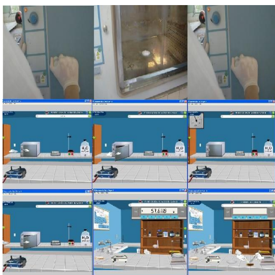
Figure 5. Sequence of actions to dry in the oven

remove the sample, return to the balance and check that the substance is completely dry.