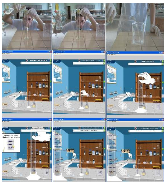
Figure 2. Sequence of actions to measure with a test tube and transfer for a beaker

simulated until the meniscus reaches the line of sight. Subsequently, the operation of transferring the liquid to the beaker is performed.