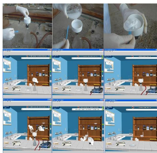
Figure 4. Sequence of actions to filter under vacuum

Some experiments require that the filtration process be carried out under vacuum. In this case, the order in which the different operations for the assembly of the equipment, the placement of the Buchner funnel and the filter paper are executed is very important; as well as the use of a stove, with the right temperature, to complete the drying process up to constant weight. This is achieved in the software, as shown in the sequence of images in Figure 4, since the student has to "take" each of the parts that make up the equipment, mount it, place the filter paper, add the substance and turn it on.