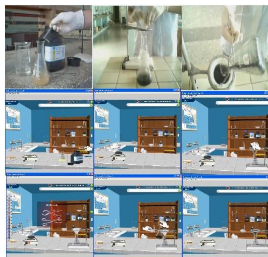
Figure 3. Sequence of actions to purify with activated coal and to filter for graviness

Fig. 3 shows, at the top, photos of the process sequence in the laboratory; while in the lower part it is possible to appreciate the sequence of user actions by adding the reagent to the container, containing the substance of the experiment; place it on the heating plate; take the filter paper and place it in the funnel; select the appropriate clamp to remove the Erlenmeyer from the heat source, once it has reached the right temperature, and take it to the support to pour it into the funnel and collect the filtered substance.