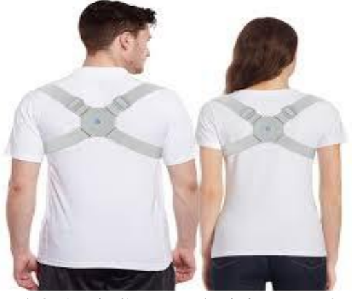
Fig3. Electrically operated existing system-3

notified by the system on his mobile device. Here the making the improvement in older posture mechanism is taken place with use of belt design and its dimension points though the electronic system is involved inside the package which can drive entire mechanism. Thus result can be achieved comparatively in shorter period of time.