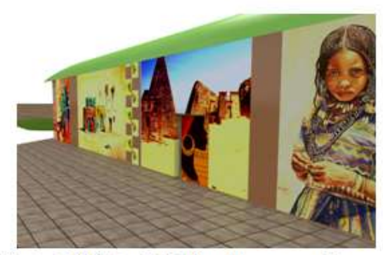
Photo (14) Cultural Building Rear perspective