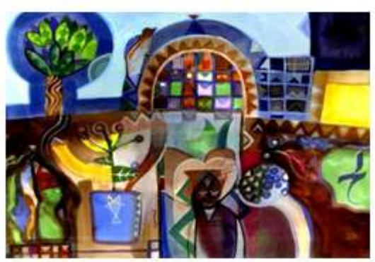
Photo (11) Painting of artist Hussein Mirghani.