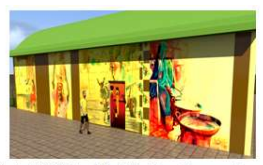
Photo (15) Cultural Building Frontal perspective