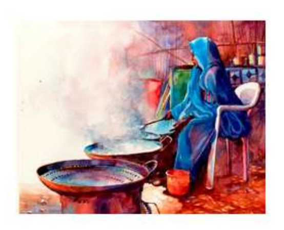
Photo (4) a painting of Sudanese artist Hussein Mirghani