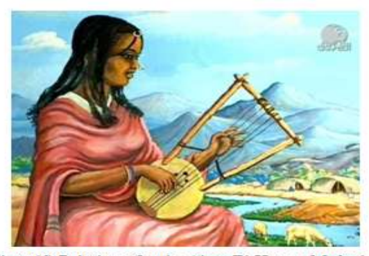
Photo(6) Painting of artist Abou El Hassan Madani