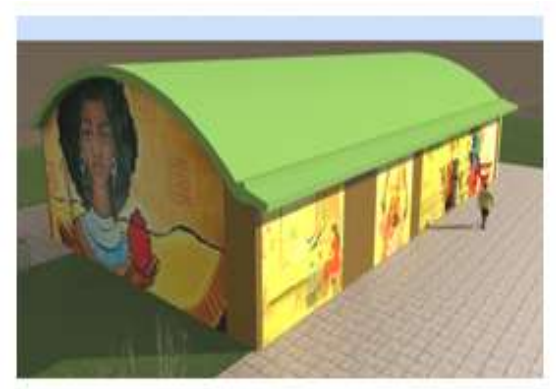
Photo (13) Cultural Building Side Perspective (A)

In the following, the researcher present a hypothetical model of cultural building, to explain how the art methods that express tribal heritage can be applied in Sudanese architecture.