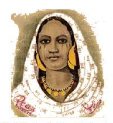
Photo(1) shows traditional features to Sudanese woman's

This style express Sudanese society customs traditions and heritage through wall drawings with joy beautiful colors, reflect the Sudanese traditional civilization in contemporary way, as follows