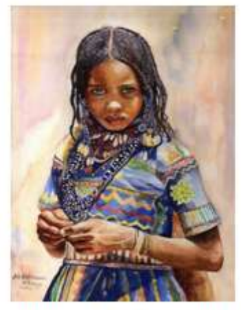
Photo (2) Painting of artist Abdul Rahman A1 - Takinah