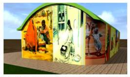
Photo (16) Cultural Building Side Perspective (B)