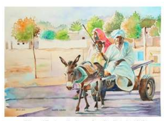
Photo(5) A painting of artist Saleh Abdo