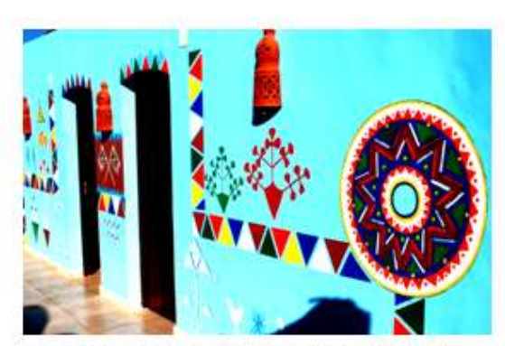
Photo (8) Photo (8) Shows Nubian symbols Represented in Kato Dool Nubian Resort elevations - Nag` Gharb Soheil, Aswan- Egypt