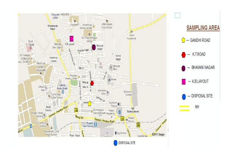
Fig.2: Geospatial Map of Tirupati Town showing sampling areas

In the present study, samples of Municipal Solid Waste are collected from different Residential, Commercial and Disposal site and analyzed for certain physical components and Energy content of the different components of Municipal Solid was determined using Bomb Calorimeter. Further ArcGIS 9.3 was used to digitize the information. Geospatial Map of the Tirupati Town is as given in the fig.2. Attribute data of sampling areas with respect to different components and energy recovery of Tirupati Municipal Solid Waste is as given in the Table 2.