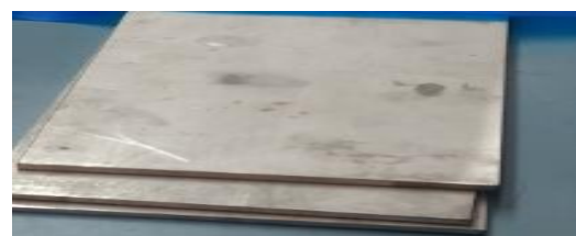
Figure 1: Raw material

Flat plates of SS 304 with dimension 300x150x6 mm are taken. The chemical composition is verified with the Material Test Certificate received with the material. Additionally PMI testing is done.