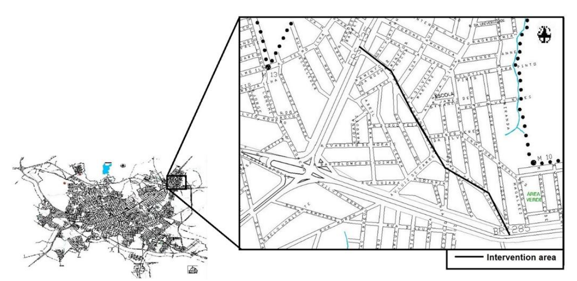
Fig. 1: location chosen for the simulation of implementation of urban equipments.

In this sense, for the accomplishment of this research, the following specific objectives were met: a) to allocate the theoretical ports according to the proposed theme; b) conduct semi-structured interviews with Urbanistic Architects, demonstrating their different technical and scientific perceptions about the process of urban requalification, thus attributing improvements in the object of study; c) and build 3D scenarios, with the requalification suggested by the interviewees.