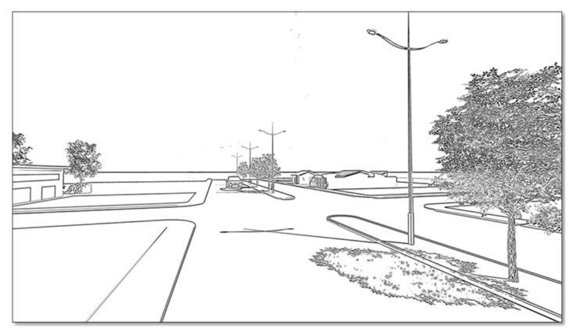
Fig. 2: site that was chosen for the simulation of the implementation of urban equipment.

guarantee the quality in the accesses and public walks that are constructed of according to the characteristics of each type of way collaborate of a significant form for the accessibility and urban mobility. Accessibility in the urban environment provides strategies that consider the main characteristics of easy access to urban mobility. The next step is the implementation of adequate drainage for the site. The technique used proposes the execution of a pluvial bed, that is, they would be installed in the middle of the sidewalk, directing the rainwater to boxes, or biovallets with their own vegetation to help in the correct drainage of rainwater. The purpose of drainage is to direct and to conduct stormwater from rainfall in cities.