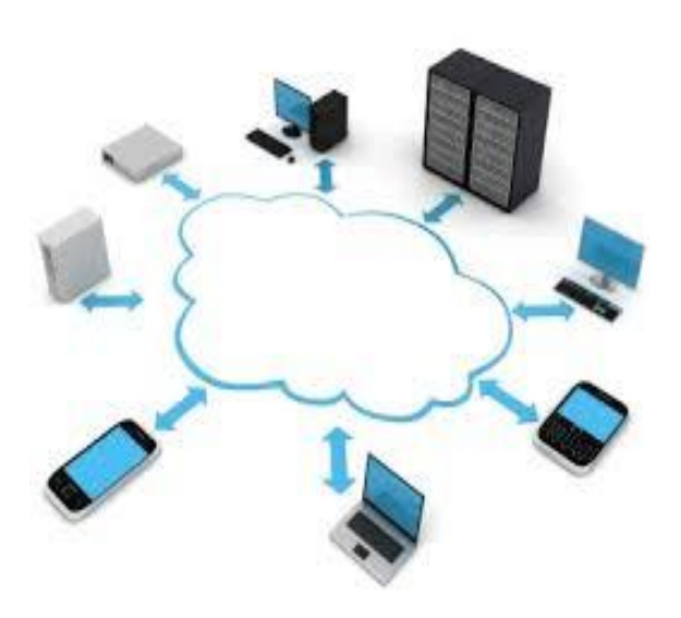
Fig. 2. Storage Types

Hybrid Cloud Storage : A Hybrid cloud offers a combination of private and public clouds. The features can be customized and the applications are inserted that meet our needs, as well as the resources that work for us. The most important data can be kept on a private cloud, while the less important data can be stored on a public cloud and accessed by a host of people remotely. Data can be stored in an efficient storage environment, which saves time and money.