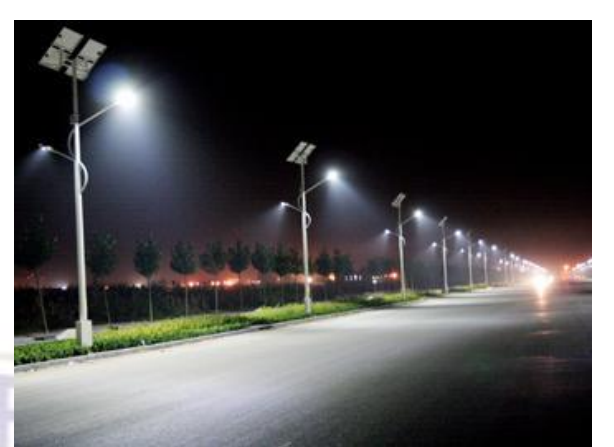
Figure 4. View of the test system.

The operational test system operating in real conditions is shown in Fig. 4. The proposed system can be used for upgrade of existing typical lampposts, as well. Power is provided by a battery, recharged from a solar panel throughout the daytime. The capacity of the battery depends on explicit parameters of the application. In the designing part of a photovoltaic system the irradiation curves of the positioning has been studied to work out the inclination and orientation of the surface of solar panels that permit the optimal operation. For the sizing of the panel it's necessary to calculate the annual energy needed to power the lighting. The charge controller manages the processes of the battery charge and power provide. Current generated by photovoltaic panels is handled by the controller to produce an output current for battery charge. The charging method should be conducted consistent with the battery knowledge (capacity, voltage, chemistry, etc.)