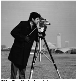
Fig3: Original image

Number of test images are considered and the results on cameraman image are presented in the table 3.