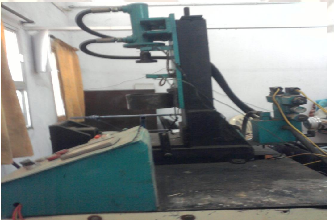
Figure 2. Actual Machine