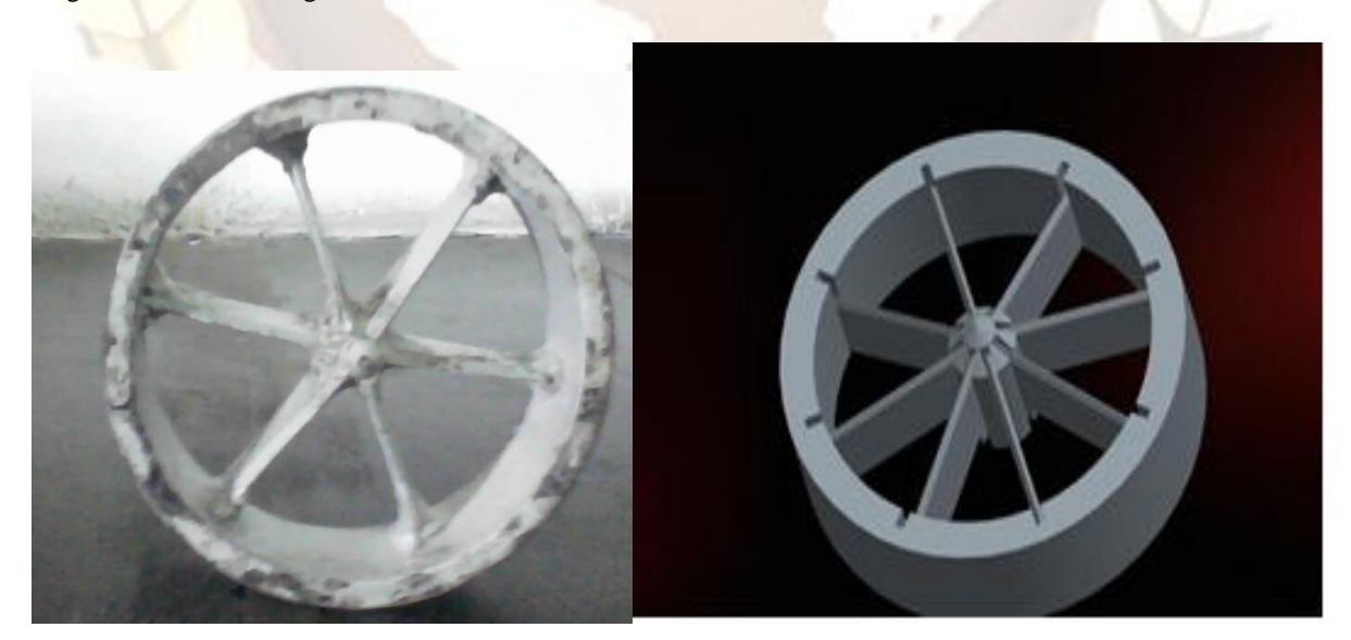
Figure 3:- Actual working Die of splitter, Cad model of splitter.

A number of experiments were conducted to study the effects of various machining parameters on bamboo processing operations. These studies have been undertaken to investigate the effects of various sizes of bamboo, speed, cutters and other machine parameters on torque, energy and time required in processing operations. During experimentation various variety and sizes of bamboo samples are collected and processed at three different speeds. For splitting operation different diameter of bamboos were taken in to consideration for obtaining cutting force required to split bamboos of different diameters. The result of the same is shown below. In the next step the already splitted bamboo pieces are forced on to the slicing tool and it gets sliced in four pieces, the actual slices are also shown in figure no 4.